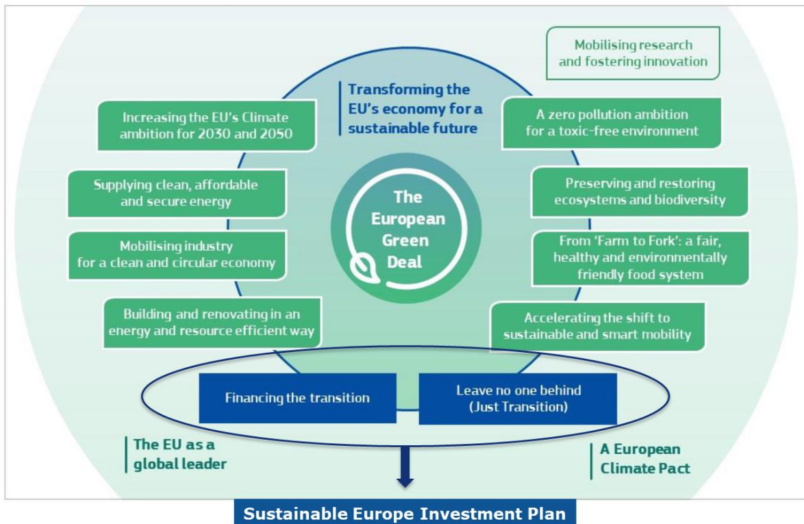
Figure 1. The Investment Plan within the European Green Deal

The Sustainable Europe Investment Plan will enable the transition to a climate-neutral, green economy across the following three dimensions: